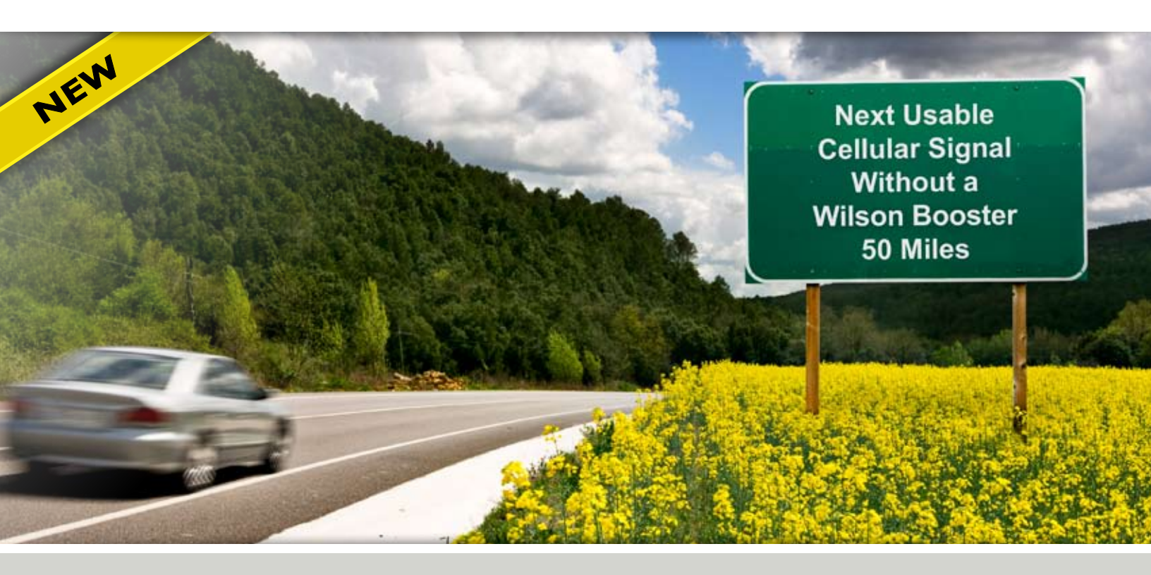
The Sleek 4G-V <sup>™</sup> – Get peak cellular performance in your vehicle for all phones including Verizon Wireless® LTE devices